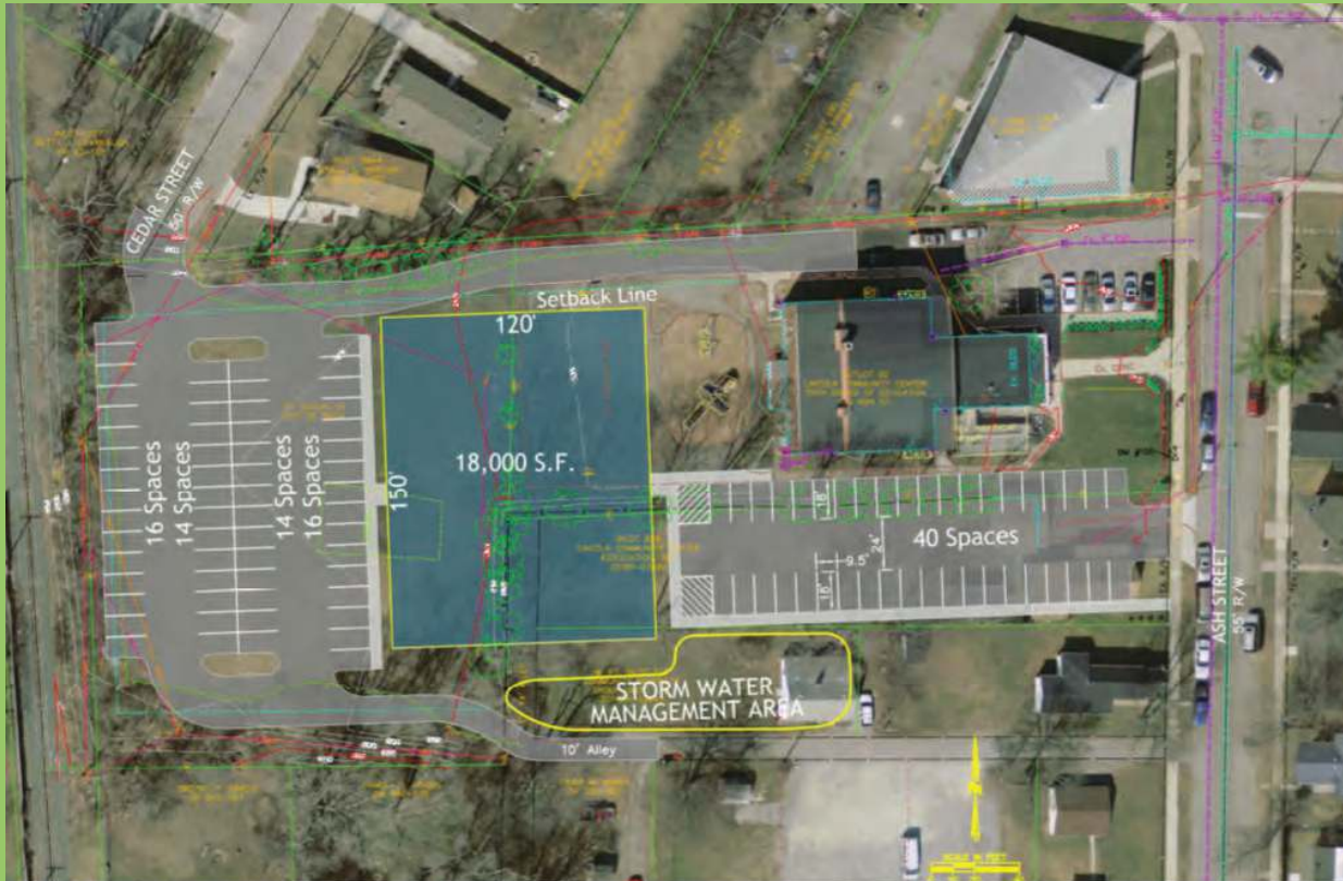
Above: Aerial view of the LCC's proposed site plan.

The new building will encourage continued community involvement by providing ADA compliant facilities and expanded parking areas as well as modern spaces for programming, services and events. With your support, we can make sure the LCC's facilities are as top-notch as our patrons, programs and community.